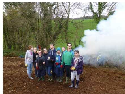
Our Volunteers from Lufton College