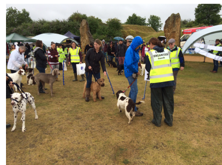
Photo from last year's Dog Show.

On 24 th July, at the Stone Circle, there will be a Fun Dog Show. This is a charity event in aid of the National Animal Trust and the Ferne Animal Sanctuary. Please turn up with your dogs to help make this event a great success. There will be stalls, trade stands, refreshments and demonstrations. The show opens at 10am with classes beginning at 11am.