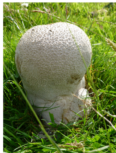
Puff Ball growing in Witcombe Valley

The Geology Trail is ongoing and we are aiming for an Earth Science week launch in October.