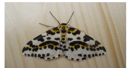
Magpie Moth ( Abraxas grossulariata )

Other events this quarter included John Day and Barrie Widden ran a Moth Trapping evening with 27 people attending, and in the school summer holidays the Ham Hill Rangers ran three afternoon events, fire lighting, den building and camp fire cooking with over fifty youngsters attending. They all enjoyed toasted marshmallows, nettle bread, elderberry jam and drinks.