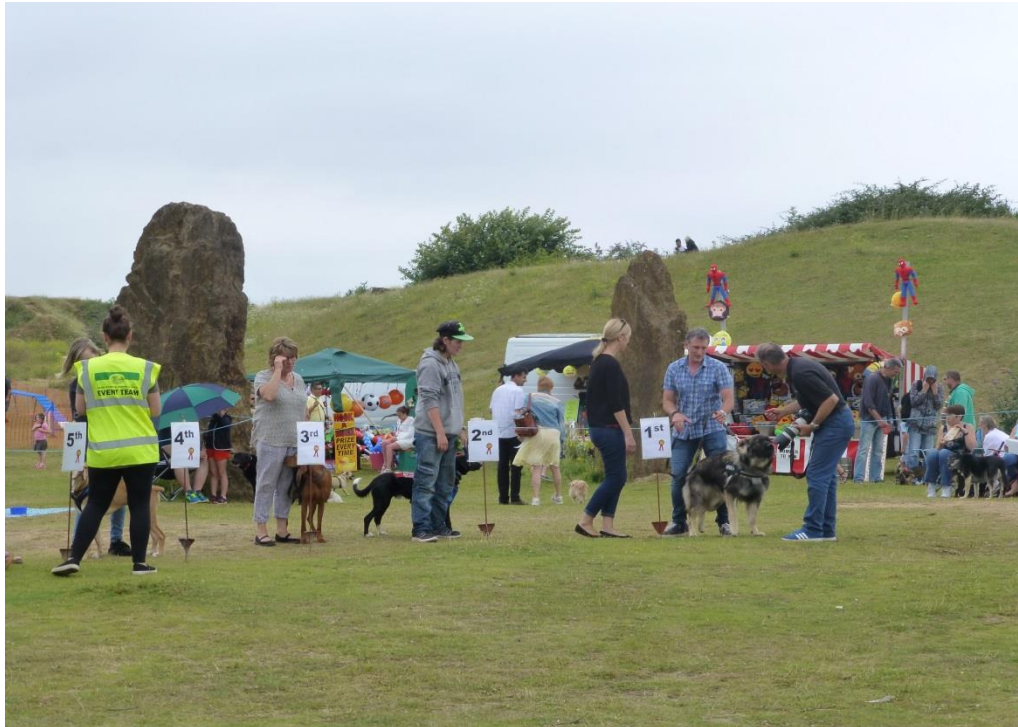
WINNERS AT THE DOG SHOW