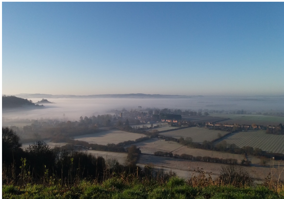
HAM HILL ON A WINTERS DAY