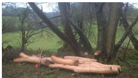
Stripped and ready

The Woodland Play Zone has also been cleared and the logs that are going to be used for the project have been stripped of bark.