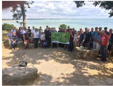
Volunteers at Studland Bay

For the 14 th time, Ham Hill has achieved the Green Flag award - the mark of a quality park or green space. This is due to staff and volunteers who work tirelessly to maintain the high standards demanded by the Award.