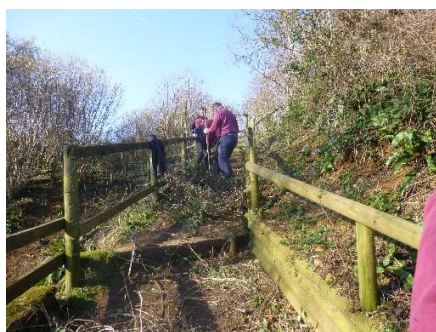
Clearing the steps to the Play zone

In March, prior to the opening of the Wildwood Play Zone the volunteers were busy clearing down the steps to the area and worked with the rangers to clear the hazel so that the play zone could be clearly seen from the Prince of Wales Pub.