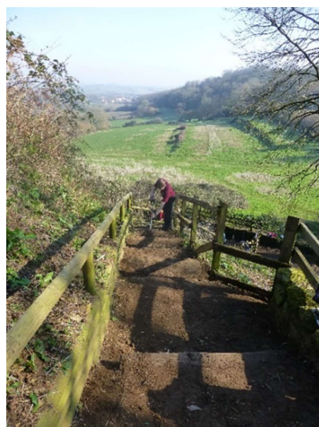
Result of a day's hard work

May we remind all visitors that with the young vulnerable lambs in Witcombe Valley please keep your dogs on a lead regardless of age, gender, breed or personality.