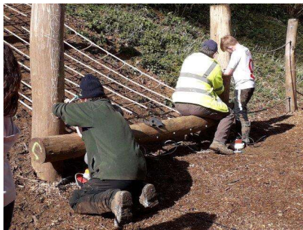
With the help of volunteers and rangers the children help to add some creative carved art.

There was excitement in the air on Monday 11 March as local school children (Castle and Norton Schools) helped unveil the new 'Wildwood Play Zone'. Thanks to a grant from the People's Postcode Lottery to the Friends of Ham Hill, rangers and volunteers have created a new natural play space full of wooden play features.