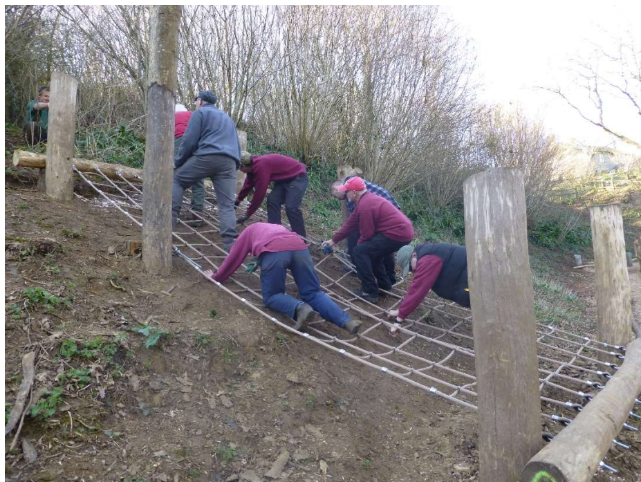
VOLUNTEERS TESTING PART OF THE PLAYZONE - HONEST!!