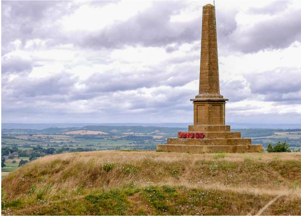
AN ENTRY IN OUR 2020 CALENDAR COMPETITION