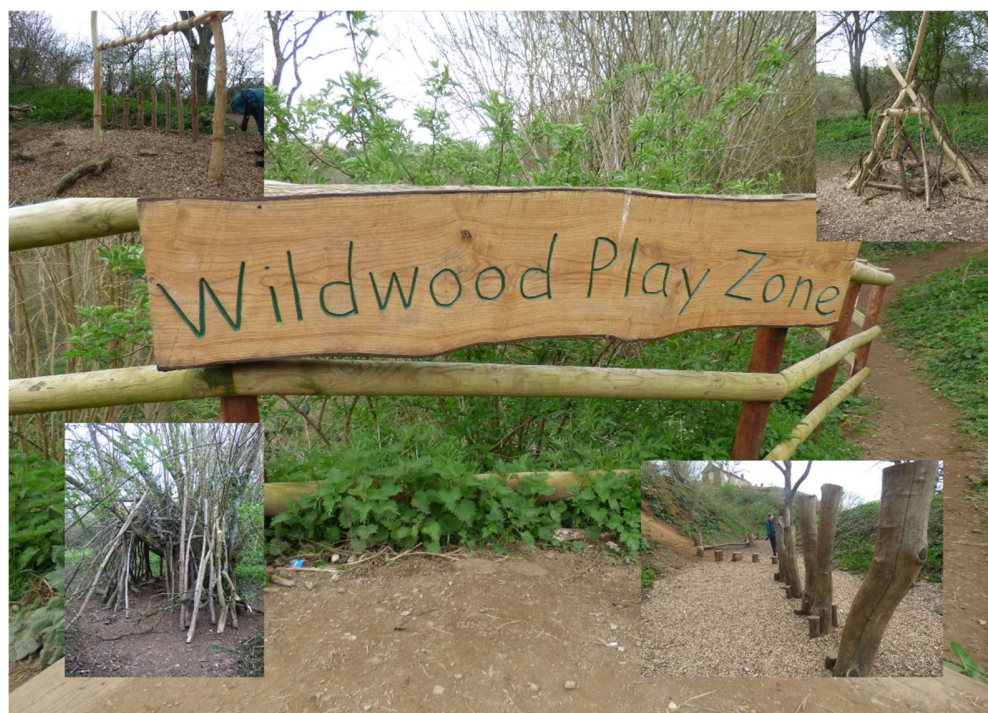
FOHH – PLAYZONE PHASE TWO PROJECT COMPLETED