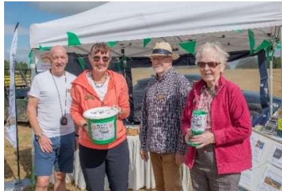
FoHH manning the tombola stall