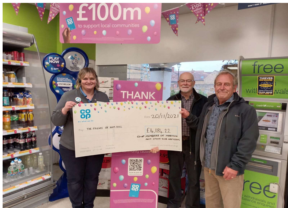
PHOTO: FRIENDS OF HAM HILL RECEIVING THE CHEQUE FROM CO-OP